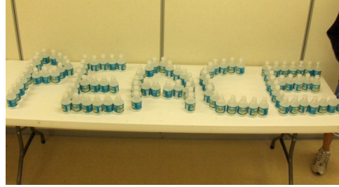
Students at the Hebrew Day School spelled out "Peace" with water bottles as they welcomed students from Orangewood Christian and Leaders Prep schools.