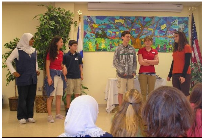
Sharing the story they created during the storytelling game.

Later this Spring, Leaders Prep School will organize a day when each school shares the teachings of their faith on "Stewardship of the Earth." Emphasis will be on environmental issues, where hands-on learning and more questions are sure to generate new environmental awareness and leadership. Our annual tree planting is scheduled for the same day. On this day, students will have an opportunity to learn more about Islam and Muslim worship.